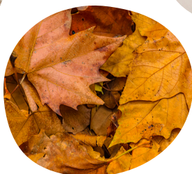
Fallen leaves and foliage