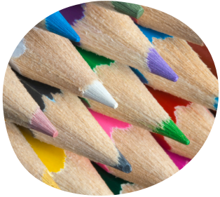
Colouring pens or pencils

Learn about the different colours and markings of UK birds with this fun and easy craft activity!