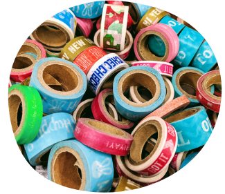
Glue or tape