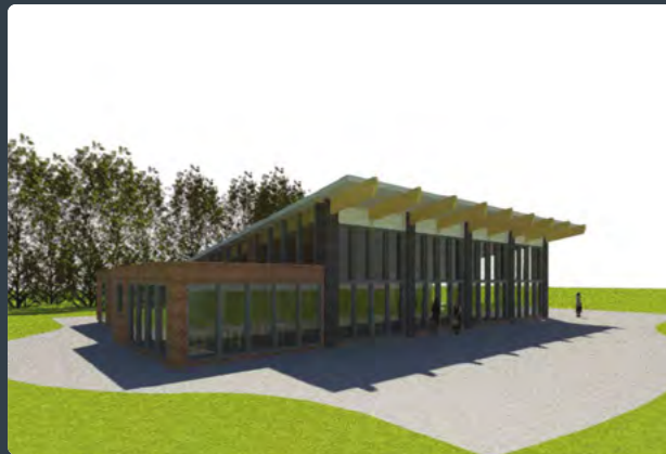
▲ In October of 2020 work started on a Jurassic themed adventure golf course, café and public toilets at Furzton Lake. This construction is still ongoing, and the new facilities are due to open in the summer of 2021. Furzton Lake has proved to be a very popular destination for people over the last year and these new additions will greatly improve the visitor experience.