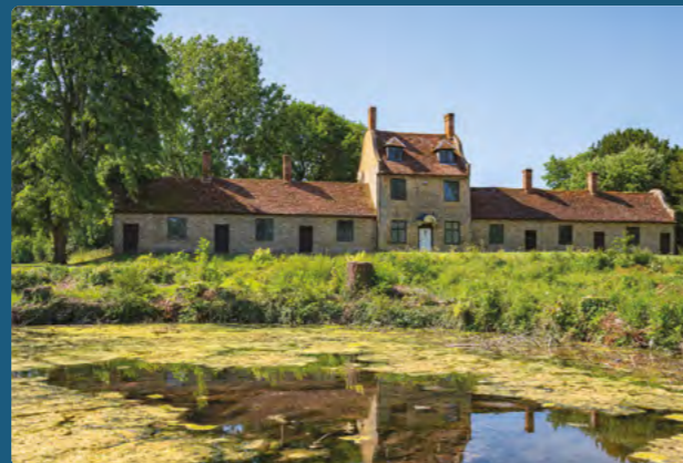
Almshouse at Linford Manor Park

The restoration of the 18th Century heritage landscape features, including the Water Gardens and the Wilderness, and the provision of enhanced access facilities at Great Linford Manor Park, will be largely completed in the year, as will the new adventure golf and café at Furzton Lake.