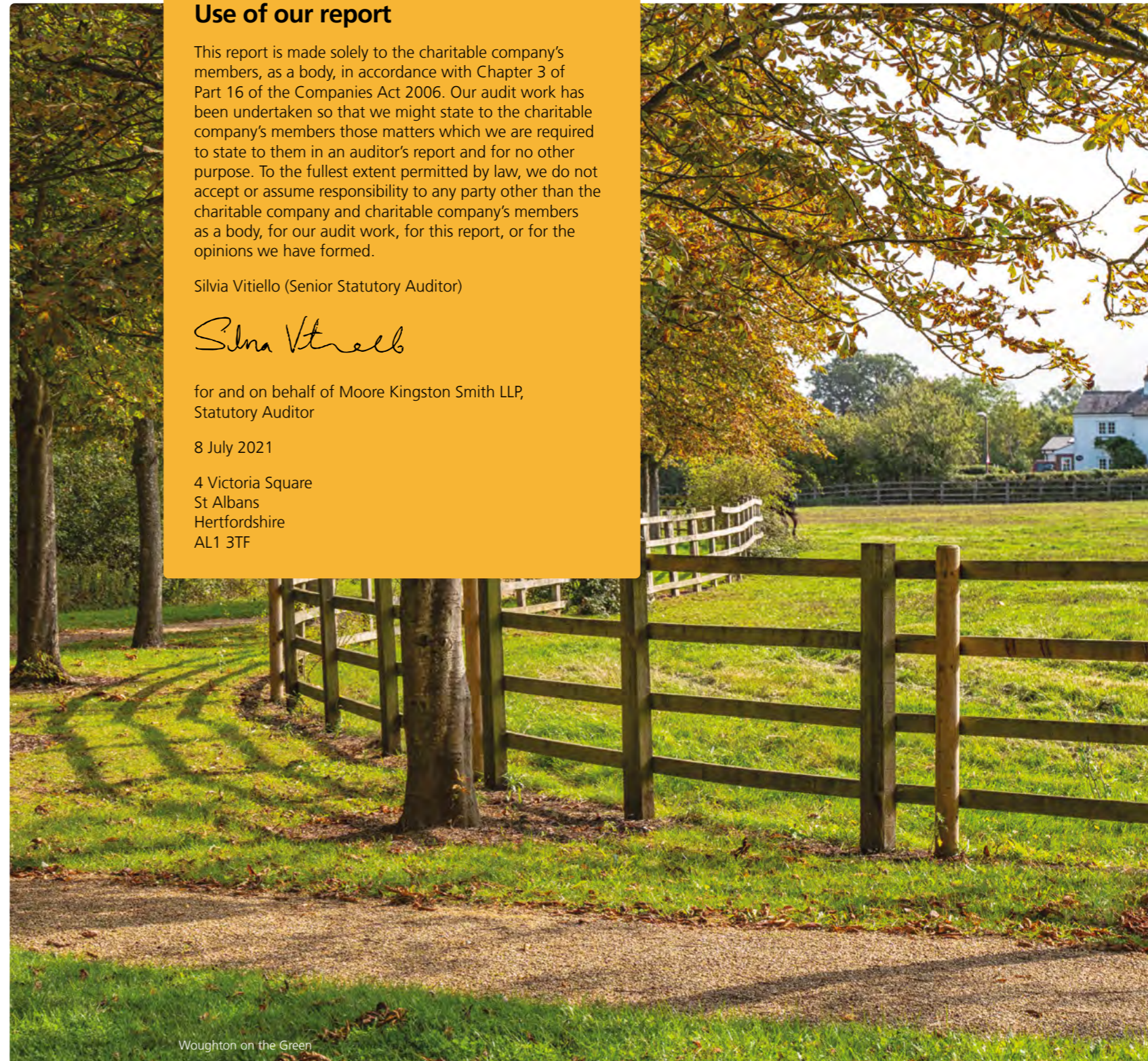
Woughton on the Green

4 Victoria Square St Albans Hertfordshire AL1 3TF