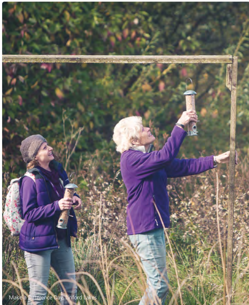
Make a Difference Day, Linford Lakes

Other volunteering includes regular practical conservation tasks and supporting our Outdoor Learning and Events Teams with community activities. It was much of this volunteer support that was suspended as a result of the pandemic in 2020.