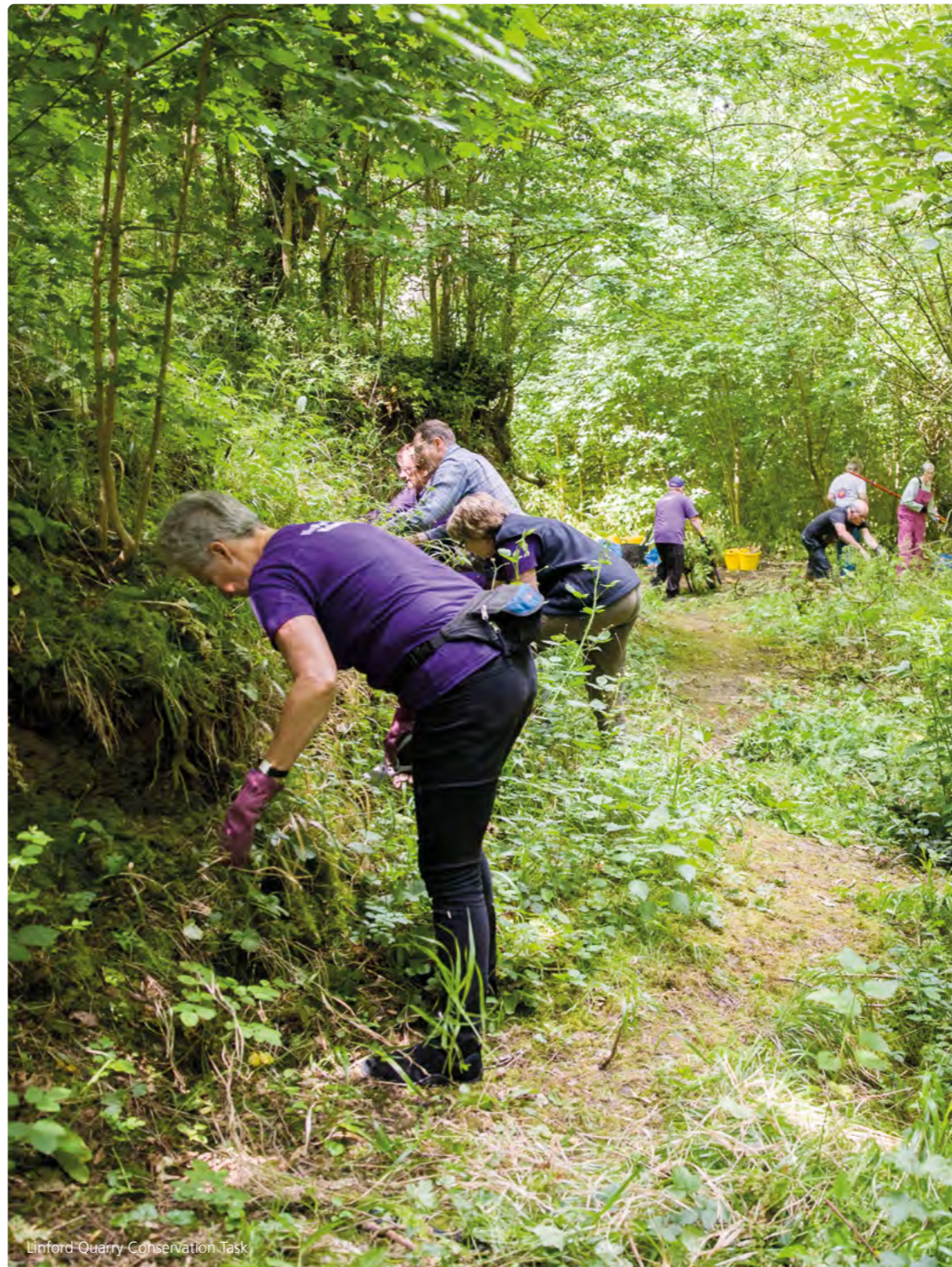
Linford Quarry Conservation Task

Each January, we hold an evening celebration event for our volunteers, looking back over the previous year and highlighting their achievements. In 2020 this event was held virtually to say thank you to all volunteers and recognise some amazing achievements.