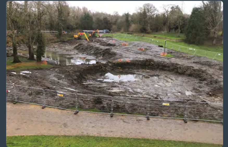
► Landscaping works commenced at Great Linford Manor Park in 2020 as we implemented our National Lottery Heritage Fund project to 'Reveal, Revive and Restore' the historic landscape and upgrade public facilities. Having been awarded £3.1m from the National Lottery Heritage Fund, we are restoring elements of the 18th century English Landscape Garden that was laid out by historic owners of the Manor.