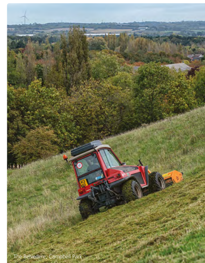
The Belvedere, Campbell Park