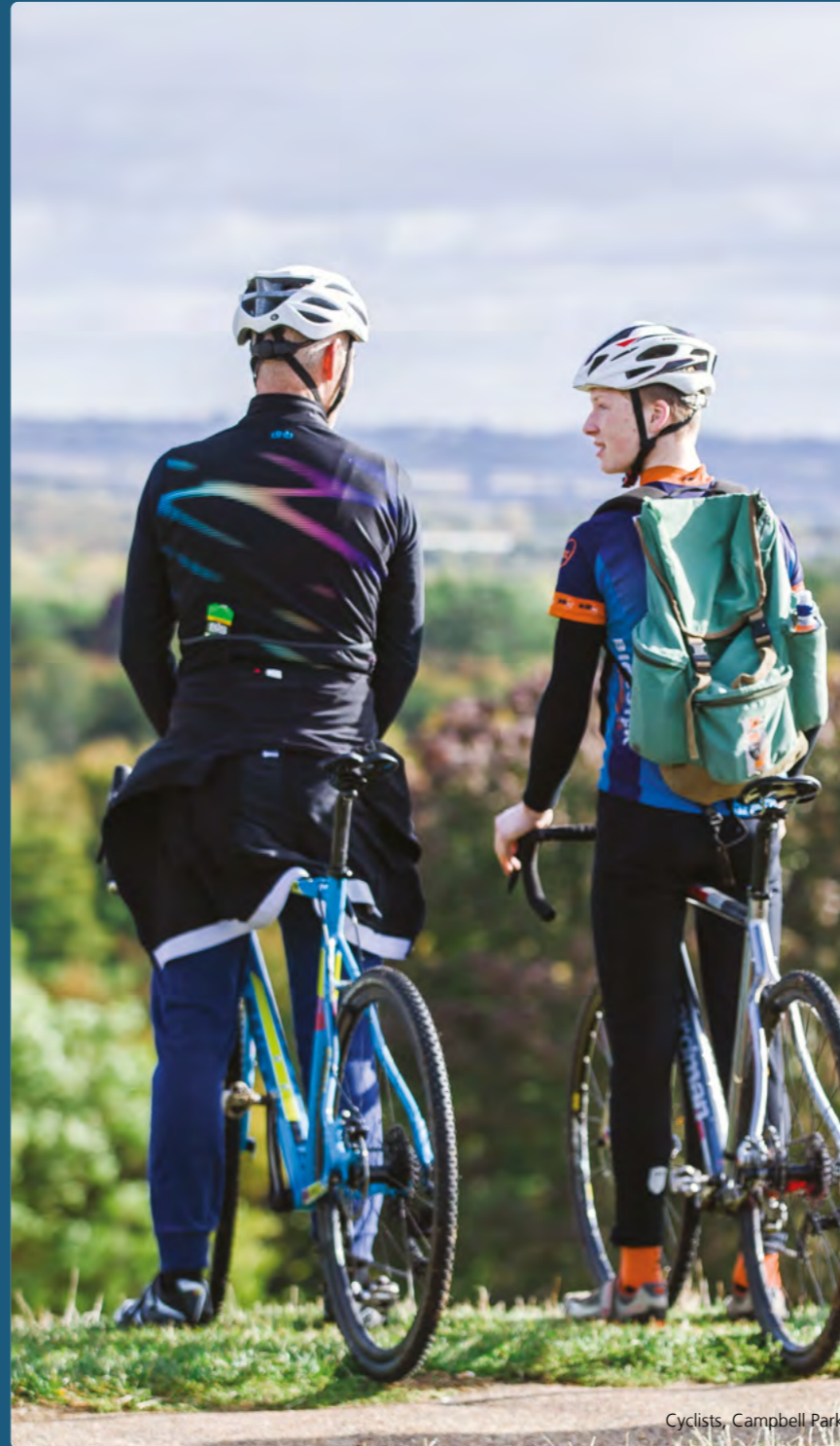
Cyclists, Campbell Park

We will continue to work with the Council's planning team and with developers towards ensuring new parks and green spaces in the growth and development areas of Milton Keynes are well designed and built and that their future stewardship is properly provided for, by being transferred to the Trust. We will set out our own bold and ambitious vision for green infrastructure in Milton Keynes by publishing our Proposition document. This will set out our view of how the expansion of the city and any new developments around it should be based on and ensure the delivery of an extended network of green and blue infrastructure that connects to the city's existing and exemplary linear parks. We will promote our Proposition to influence not only the development plan for Milton Keynes but also the wider plans for the Oxford to Cambridge Growth Arc. We will seek to influence the environmental strategy for the Growth Arc so that this not only includes the establishment of new green infrastructure to support and mitigate the effects of urban development but also that it establishes a policy and delivery framework that will secure the sustainable long term stewardship of green infrastructure, as was achieved for the linear parks in Milton Keynes through the creation of The Parks Trust.