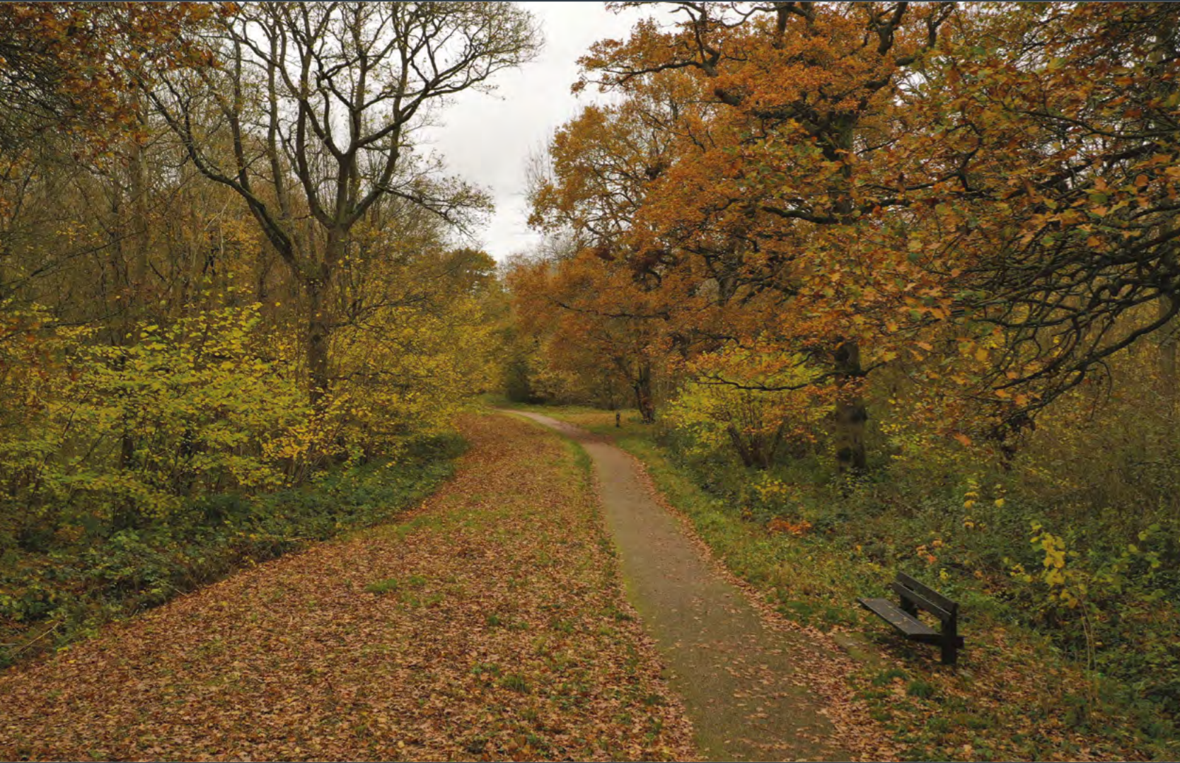
▲ In September we asked if you could help your local woodland by collecting acorns from Howe Park, Shenley or Linford Wood and plant them at home or school to grow. This was to help us replace lost and dying trees that are affected with Ash dieback. By the end of 2020, 4,013 acorns had been collected and will be nurtured for a couple of years before being planted back into woodlands.