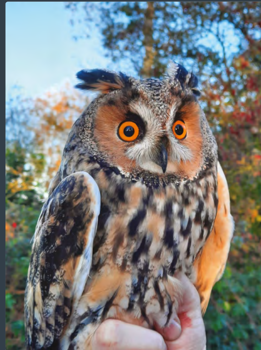
◀ In November of last year, we were lucky enough to witness a Long-eared Owl at Linford Lakes Nature Reserve. These beautiful birds were frequent visitors to the site back in the 1980's but have since been a very rare sight and this is the first Long-eared owl ringed at this location.