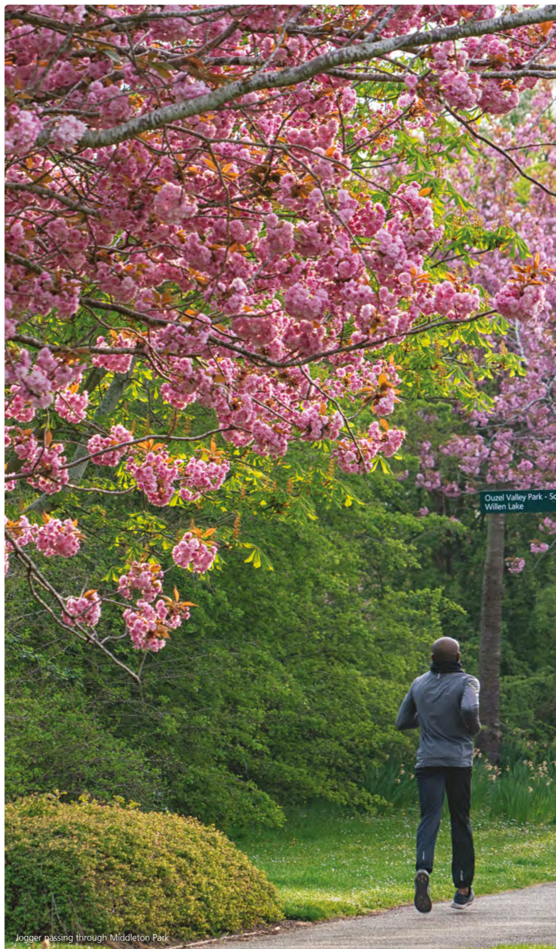
Jogger passing through Middleton Park

Rentals payable under operating leases are charged to the statement of financial activities on a straight-line basis over the lease term.