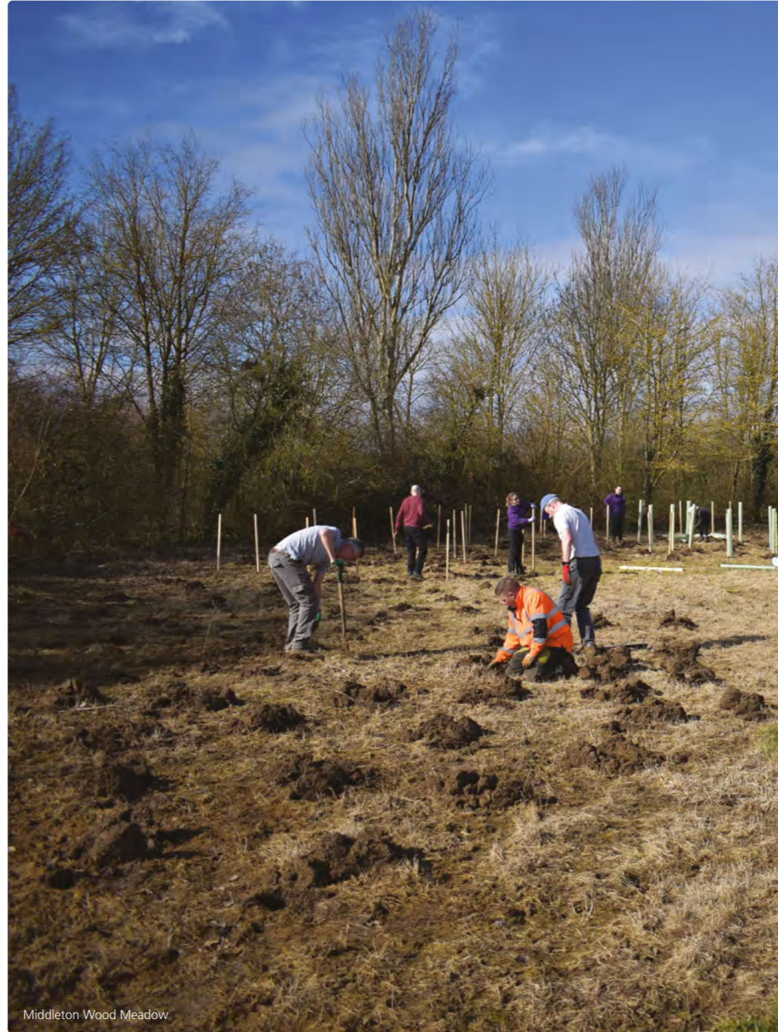
Middleton Wood Meadow