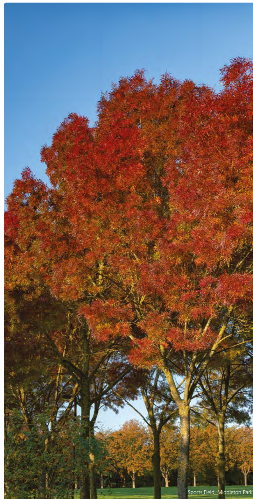
Sports Field, Middleton Park

Cash and cash equivalents include cash at bank and in hand and highly liquid interest-bearing securities with maturities of three months or less.