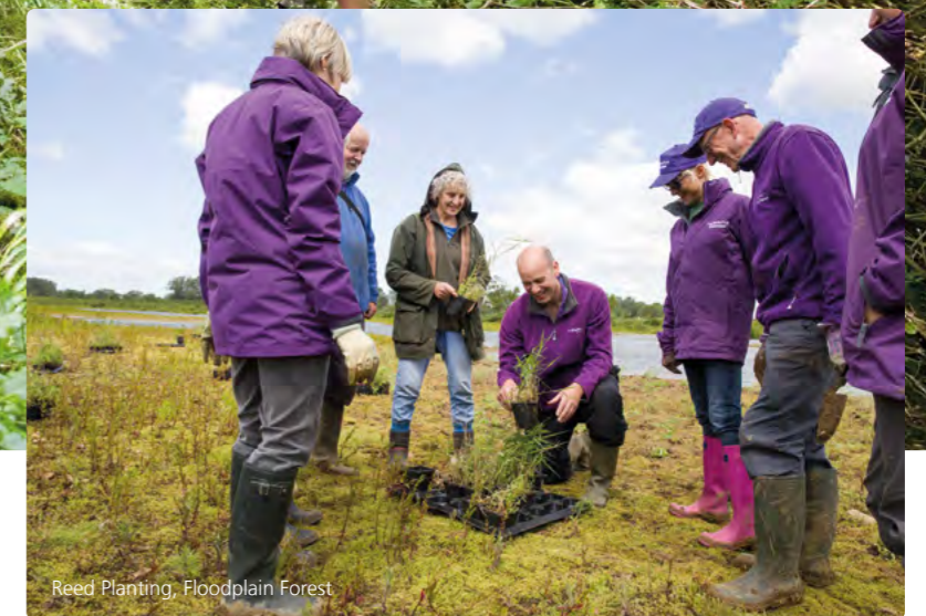
Reed Planting, Floodplain Forest

We are very grateful to all our volunteers for the help and support they provide. We look forward to continuing to work together over the year to come.