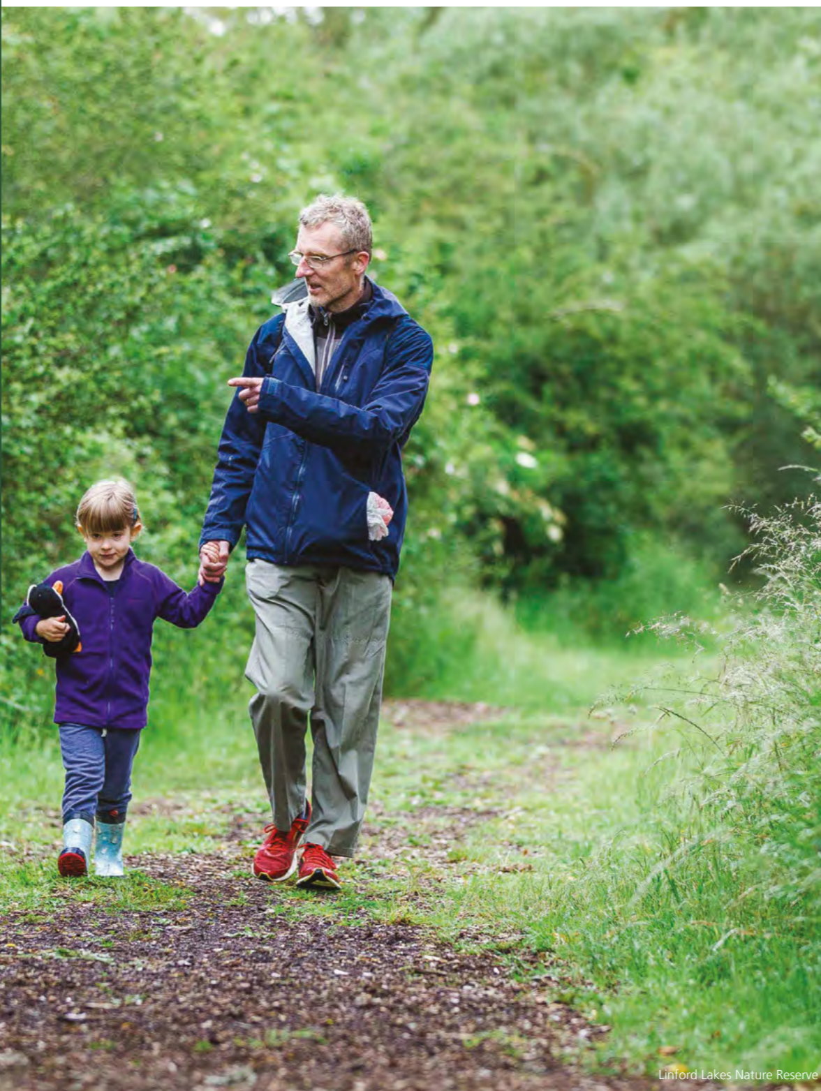
Linford Lakes Nature Reserve

The desktop valuation is carried out in accordance with the criteria set out by the Royal Institution of Chartered Surveyors (RICS). Some of our investment properties have been assessed internally.