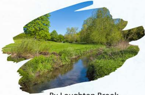
By Loughton Brook

3. Look at the images below. Discuss why each of these would have helped people to live at Bancroft.