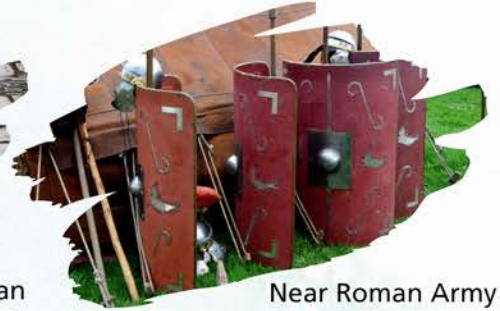
Near Roman Army Camps