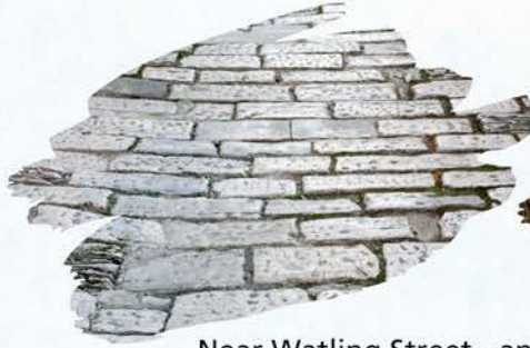
Near Watling Street - an important Roman Road