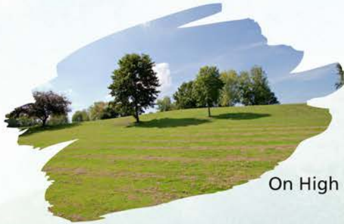
On High ground