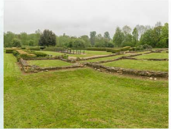
Illustration Copyright 2023 Chiba Creative

The villa was built during the Roman period. The Romans invaded in 43 CE and ruled until around 400 CE. The Roman soldiers did not live in the villa but lived in army camps nearby, at Towcester and near Fenny Stratford. The villa would have been owned by a rich local who traded or cooperated with the Romans. The building you can see on site was built in 340 CE.